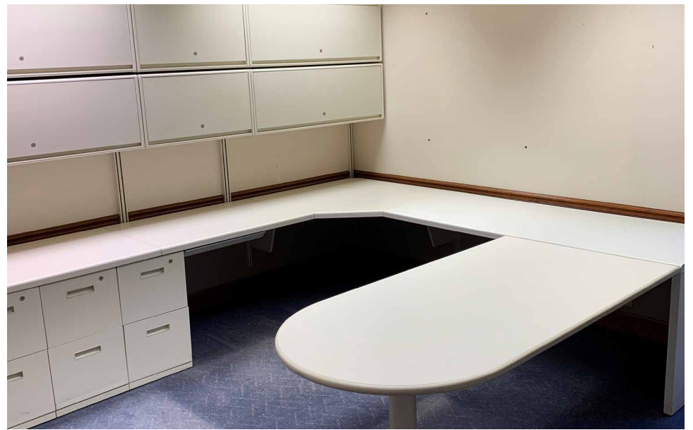
SPACIOUS LAYOUT WITH ABUNDANT NATURAL LIGHT