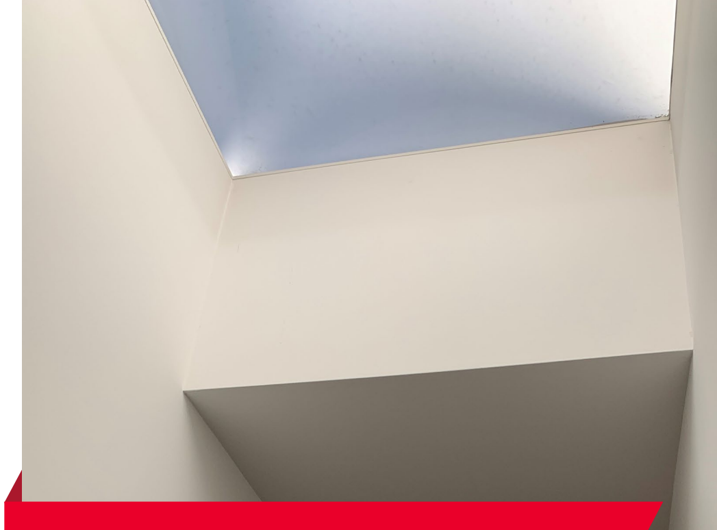
Spacious layout with abundant natural light